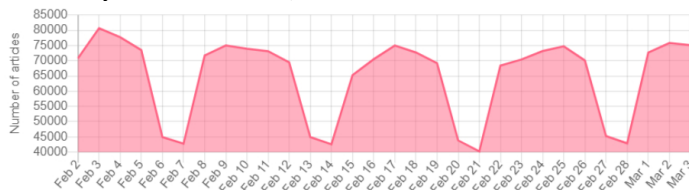
Figure 1 Media reports on Covid-19

Coronavirus disease 2019 (COVID-19) caused by severe acute respiratory syndrome coronavirus 2 (SARS-CoV-2) remains a mayor news topic, with over 75 thousand articles per day (in 70 languages, as detected by EMM/MEDISYS ).