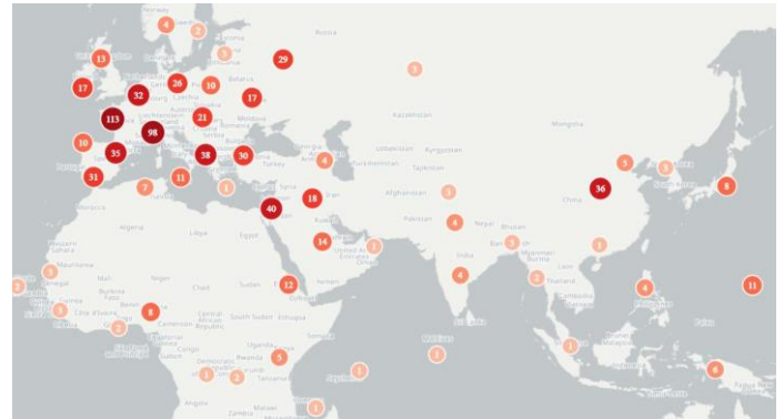
Figure 2 Geolocations mentioned in coronavirus media reports showing clusters of media reports