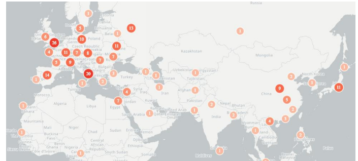
Figure 2 Geolocations mentioned in coronavirus media reports showing clusters of media reports on Italy, France, Spain, Germany, the UK, Russia, Egypt, China, South Korea and Japan