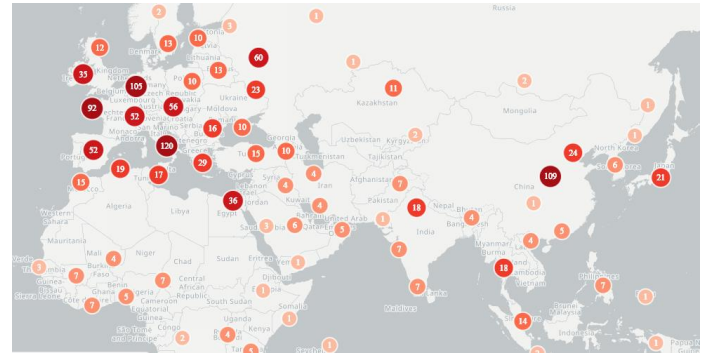
Figure 2 Geolocations mentioned in coronavirus media reports showing large clusters of media reports on Italy, France, Spain, Germany, the UK, Russia, Egypt, China, South Korea and Japan