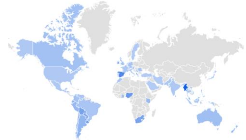
Figure 4 The map shows the popularity of the search in a given country on 28 April. The darker the colour, the more popular the search (source: Google Trends).

Among EU Member States, Spain seems to be the country with the highest number of searches on the topic on 28 April. Spanish fact checkers have already debunked the story ( newtral ).