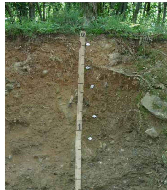
The soil in profile: by digging down into the ground to a depth of 1 or 2 metres, soil layers, or 'horizons' can be seen that have different colours, physical structures and chemical characteristics, reflecting local soil farming processes.

As the Commission's in-house science service, the Joint Research Centre (JRC) provides evidence-based scientific and technical support to policies, including those that deal with soil and land management. Through collaboration with the broader soil science community, the JRC collects, analyses and synthesises data and knowledge on the state of soils from across the EU and beyond to provide focused assessments of soil resources on a European and global scale, and the pressures that may cause their degradation.