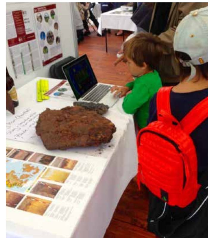
The JRC soil exhibit at the European Science Open Forum in Copenhagen in June 2014.

Through colourful maps and illustrations, the atlases explain in a simple and clear manner the diversity of soils across different continents, and stress the need to manage them in a sustainable manner.