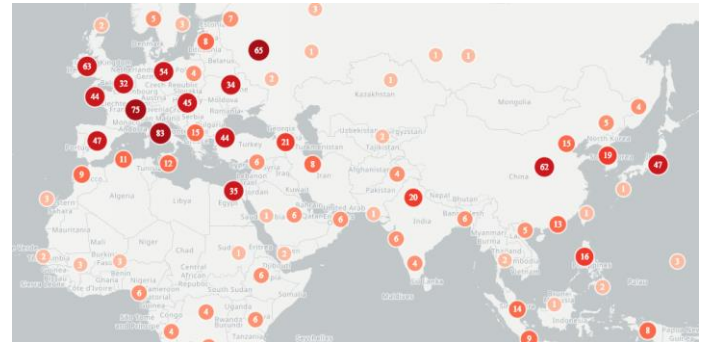
Figure 2 Geolocations mentioned in coronavirus media reports showing large clusters of media reports on Italy, France, Spain, Germany, the UK, Turkey, Russia, India, China, South Korea and Japan