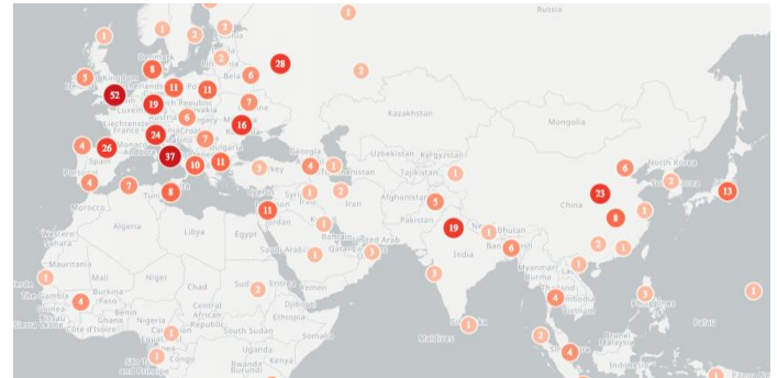
Figure 2 Geolocations mentioned in coronavirus media reports showing large clusters of media reports on Italy, France, Spain, Germany, the UK, Russia, India, China, South Korea and Japan