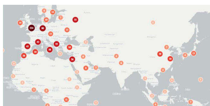
Figure 2 Geolocations mentioned in coronavirus media reports showing clusters of media reports