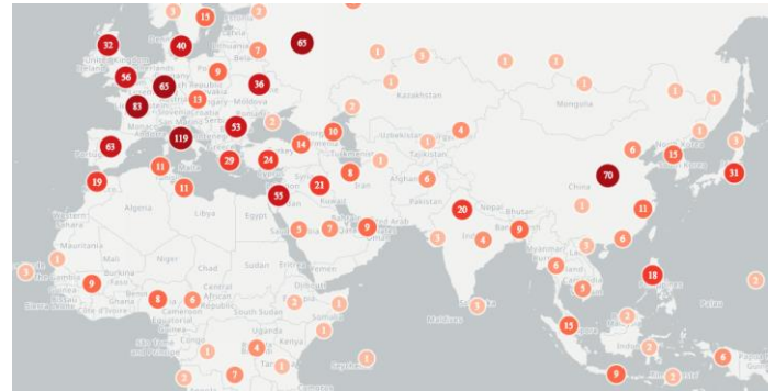
Figure 2 Geolocations mentioned in coronavirus media reports showing large clusters of media reports on Italy, France, Spain, Germany, the UK, Russia, China, South Korea and Japan