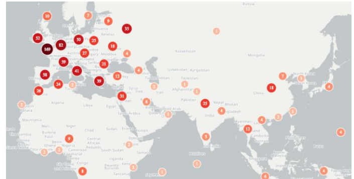
Figure 2 Geolocations mentioned in coronavirus media reports showing clusters of media reports on Italy, France, Spain, Poland, Germany, the UK, Russia, India and China