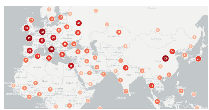
Figure 2 Geolocations mentioned in coronavirus media reports showing large clusters of media reports on Italy, France, Spain, Germany, the UK, Russia, Egypt, China, South Korea and Japan