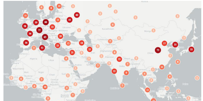
Figure 2 Geolocations mentioned in coronavirus media reports showing large clusters of media reports on Italy, France, Spain, Germany, the UK, Russia, India, China, South Korea and Japan