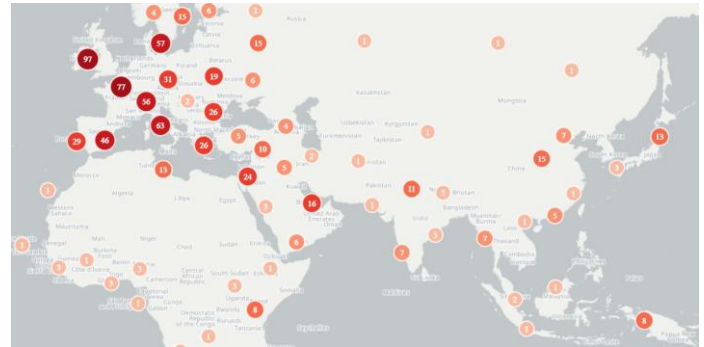
Figure 2 Geolocations mentioned in coronavirus media reports showing clusters of media reports