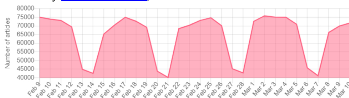
Figure 1 Media reports on Covid-19

Coronavirus disease 2019 (COVID-19) caused by severe acute respiratory syndrome coronavirus 2 (SARS-CoV-2) remains a mayor news topic, with over 70 thousand articles per day (in 70 languages, as detected by EMM/MEDISYS ).