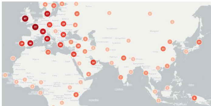
Figure 2 Geolocations mentioned in coronavirus media reports showing clusters of media reports