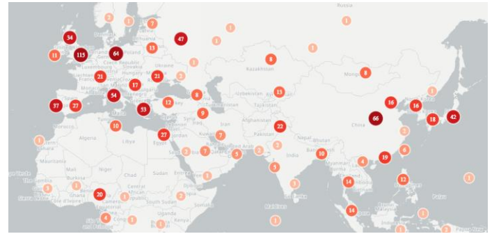
Figure 2 Geolocations mentioned in coronavirus media reports showing clusters of media reports on Italy, France, Spain, Germany, the UK, Russia, Egypt, India, China, South Korea and Japan