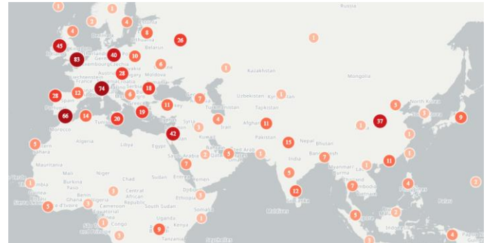
Figure 2 Geolocations mentioned in coronavirus media reports showing clusters of media reports on Italy, France, Spain, Germany, the UK, Russia, India, China, South Korea and Japan