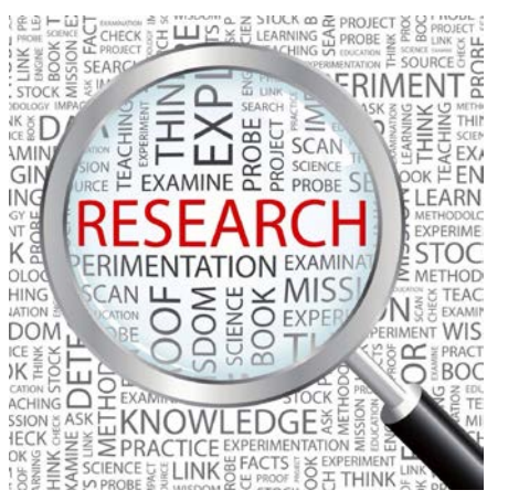
Goal 4: Support to Research & Innovation