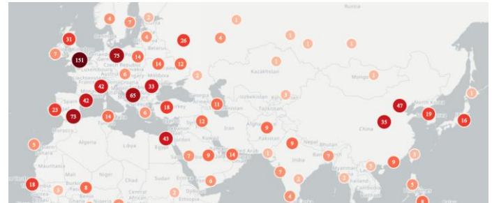
Figure 2 Geolocations mentioned in coronavirus media reports showing clusters of media reports on Italy, France, Spain, Germany, the UK, Russia, Egypt, India, China, South Korea and Japan