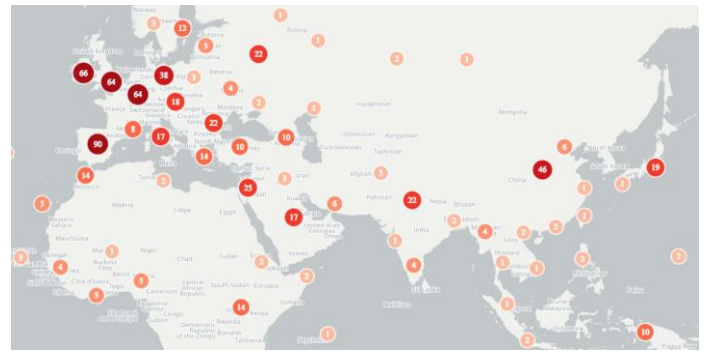
Figure 1 Geolocations mentioned in coronavirus media reports showing clusters of media reports