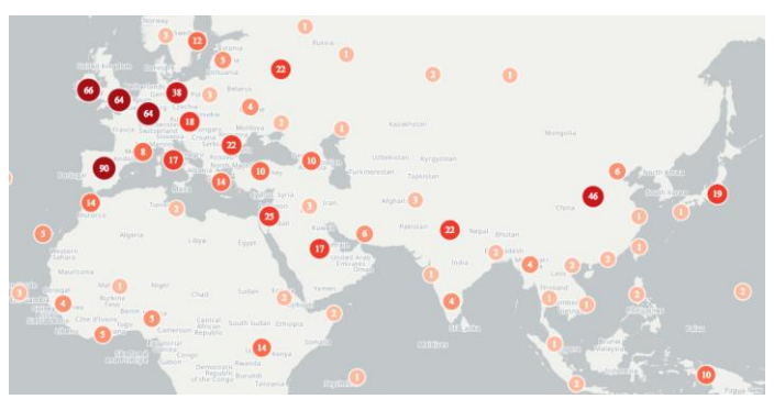
Figure 1 Geolocations mentioned in coronavirus media reports showing clusters of media reports