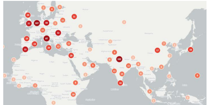
Figure 2 Geolocations mentioned in coronavirus media reports showing clusters of media reports