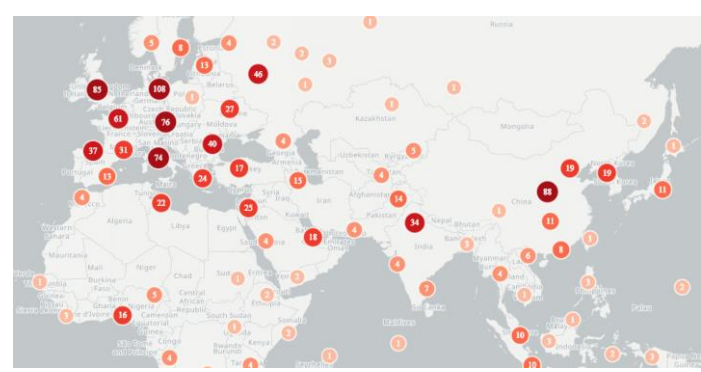
Figure 2 Geolocations mentioned in coronavirus media reports showing large clusters of media reports on Italy, France, Spain, Germany, the UK, Russia, India, China, South Korea and Japan