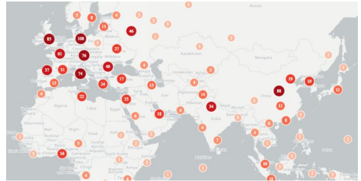
Figure 2 Geolocations mentioned in coronavirus media reports showing large clusters of media reports on Italy, France, Spain, Germany, the UK, Russia, India, China, South Korea and Japan (source: EMM/MEDISYS)